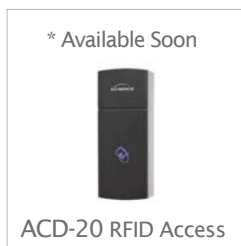
ACD-20 RFID Access